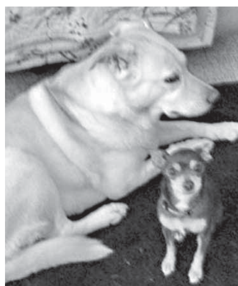
Gidget finds a friend.

“Thank you for the pictures. Gidget is spoiled already. She is not housebroken or pad-trained. We have had many accidents, but I know it takes longer to train a Chihuahua than other breeds and are not worried about it. Sometimes she doesn't go outside and waits to go inside, but in time that will pass. She is on a leash out in back when we take her out and she does quite well really. She knows her beds (yes, one upstairs and one downstairs)--the one upstairs is on our bed between our pillows, so she runs up on the bed and climbs into her bed at night. What's really cute is her sleeping in clean clothes